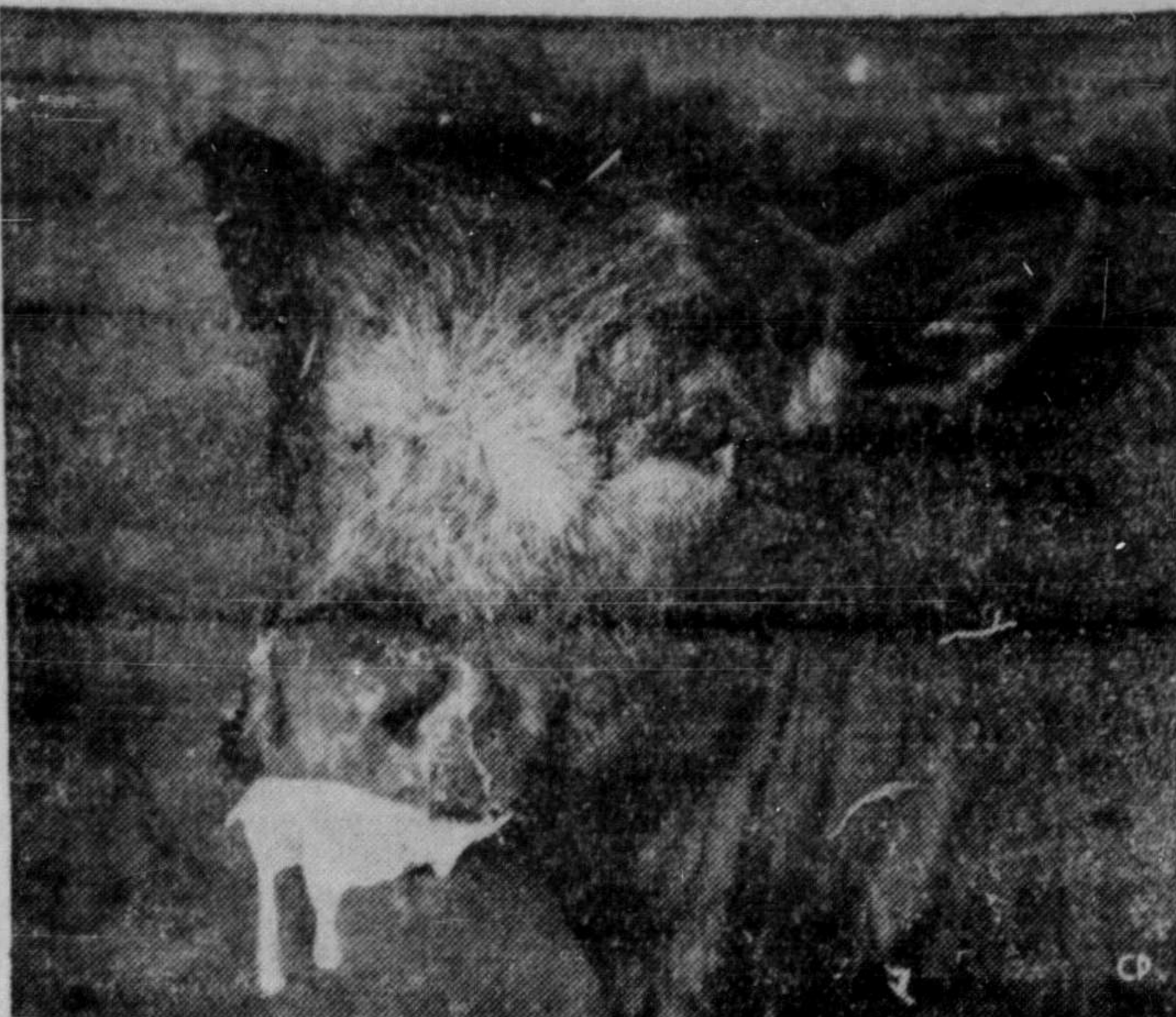
FOOT-AND-MOUTH VICTIM —Here is one of the Regina district's foot-and-mouth disease victims. White slobbering from the mouth is one of the major symptoms. Often blisters appear on the tongue and udders of stricken dairy cows. This photo of one of the victims of the outbreak was taken by the Saskatchewan Department of Agriculture.