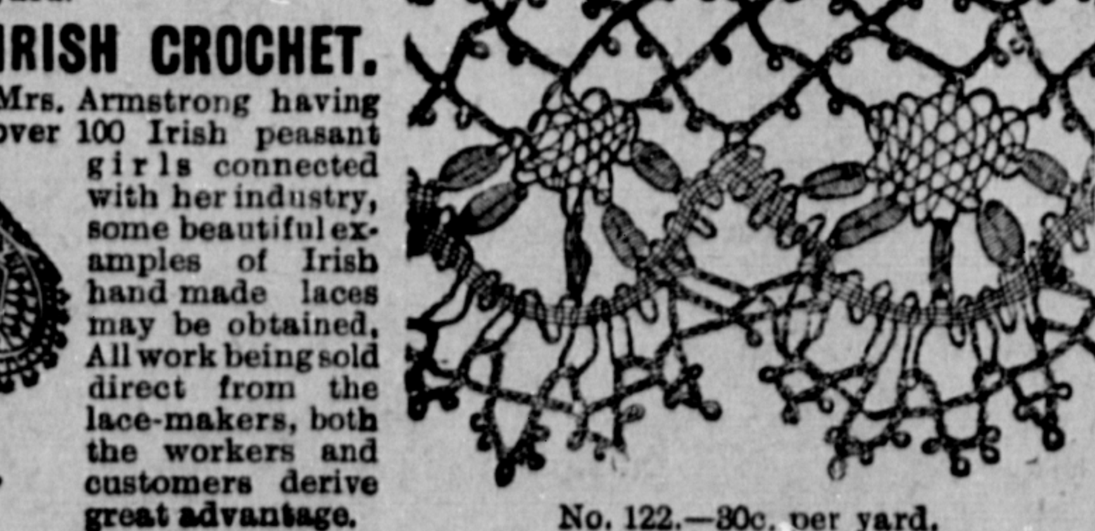
No. 122.—80c. per yard.