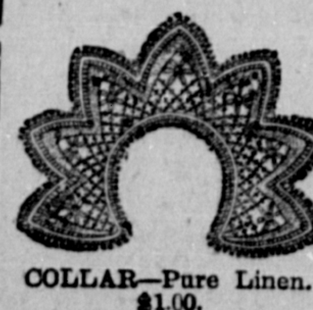
COLLAR—Pure Linen. $1.00.

BUY some of this hand-made Pillow Lace, it lasts MANY times longer than machine made variety, and imparts an air of distinction to the possessor, at the same time supporting the village-lace-makers, bringing them little comforts otherwise unobtainable on an agricultural man's wage. Write for descriptive little treatise, entitled "The Pride of North Bucks," containing 200 striking examples of the lace makers' art and is sent post free to any part of the world. Lace for every purpose can be obtained, and within reach of the most modest purse.