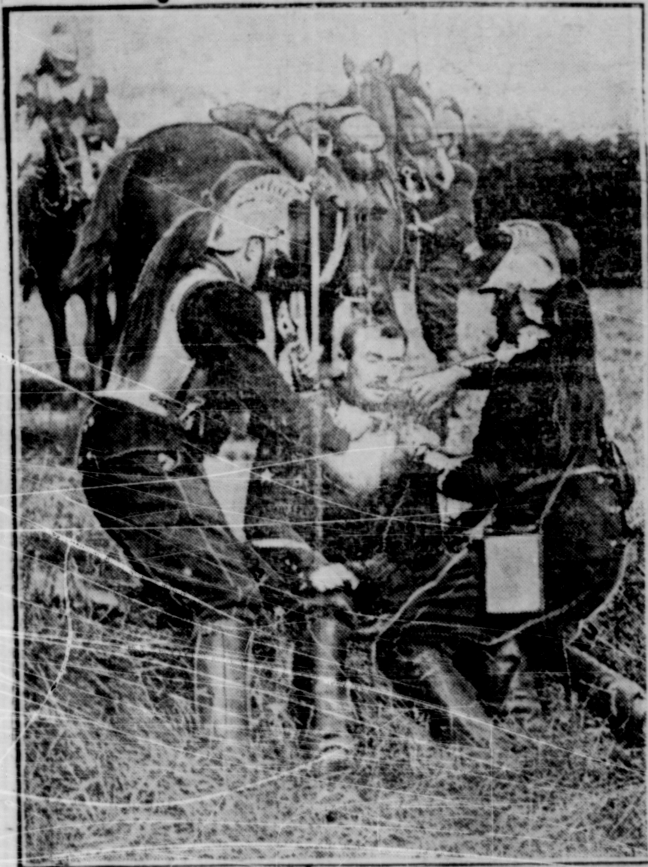
HELPING A WOUNDED FRENCH CAVALRYMAN.

First-class Cafe in Ru- pert can be had at reason- able price. Best business in town. Apply Box 16, Daily News.