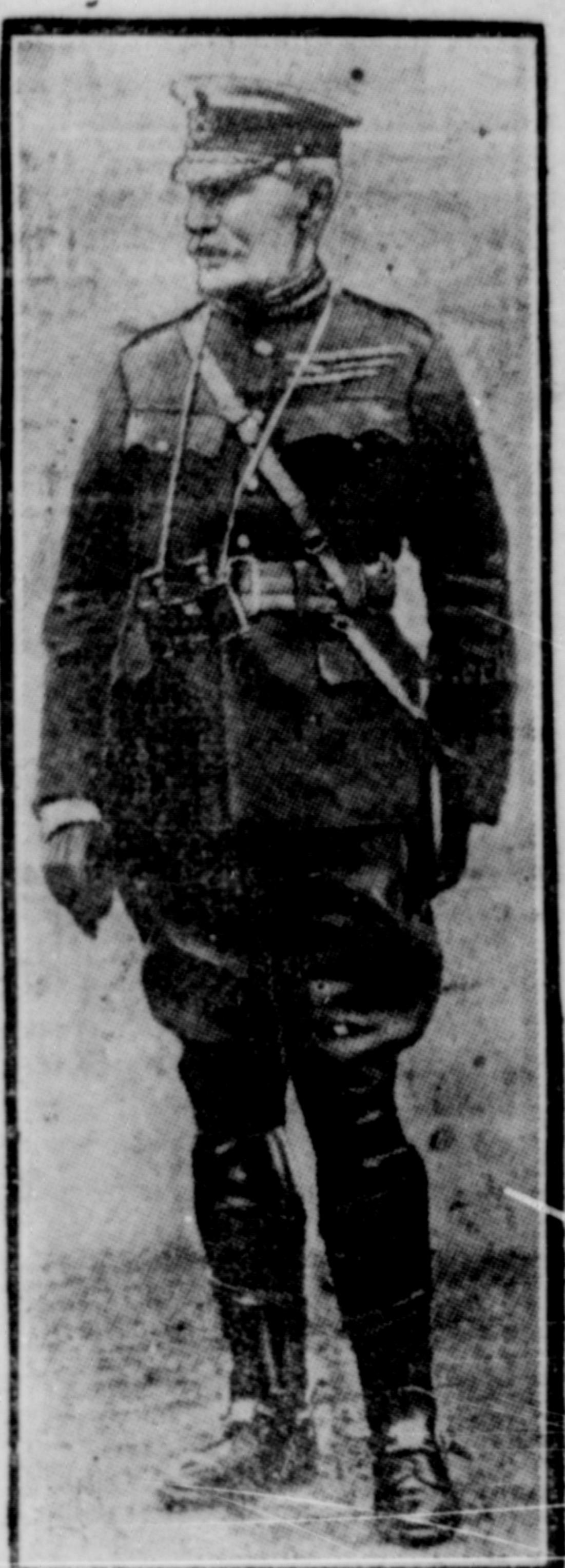
THE SAVIOUR OF THE BRITISH LEFT WING.

General Sir Horace Smith-Dor- rien, whom General French praised very highly for prac- tically saving the British left wing on August 26. His cool- ness, intrepidity and determi- nation were what was needed to extract the British forces from a hazardous position.