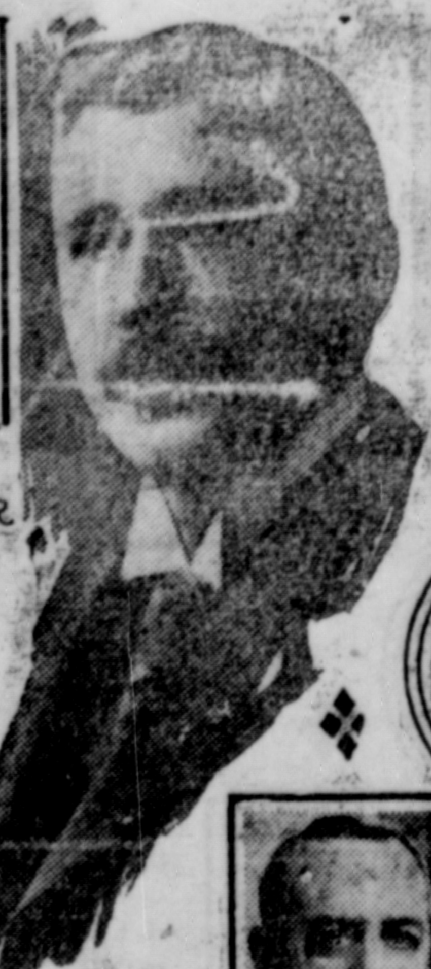
HON. W. H. HEARST PREMIER