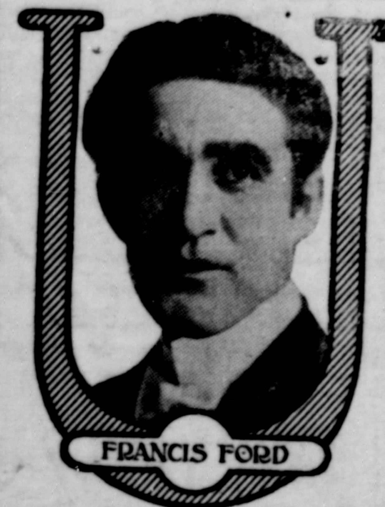
In Peg O' The Ring at the Westholme Theatre tonight.

Lord Northcliffe has published a book entitled "At the War". The proceeds are to be devoted to