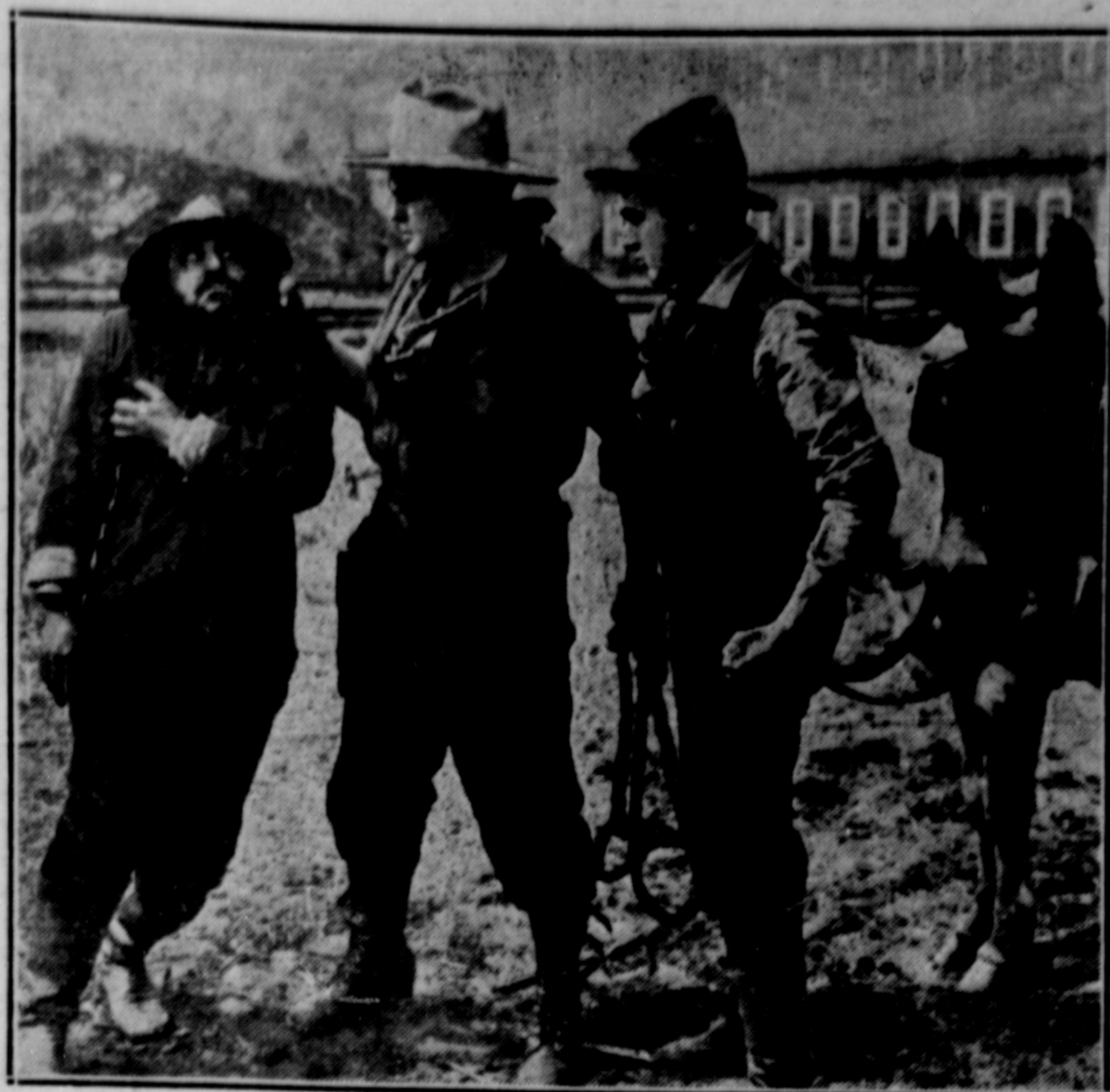
Scene from "The Plunderer," the Fox-feature at the Westholme Theatre tonight.