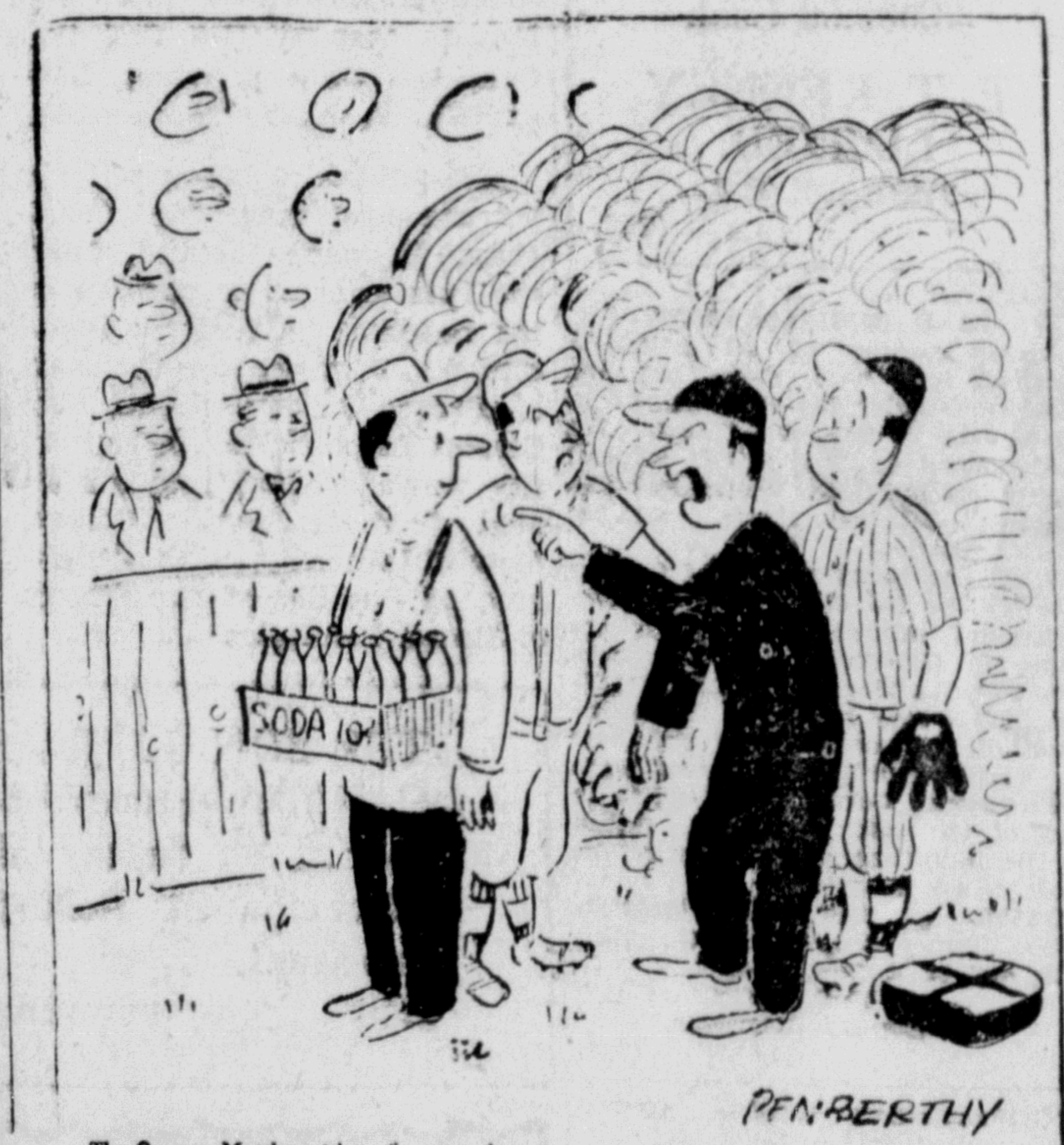
The George Matthew Adams Service, Inc.

"I saw him tag you out, Benson! Are you questioning my eyesight?"